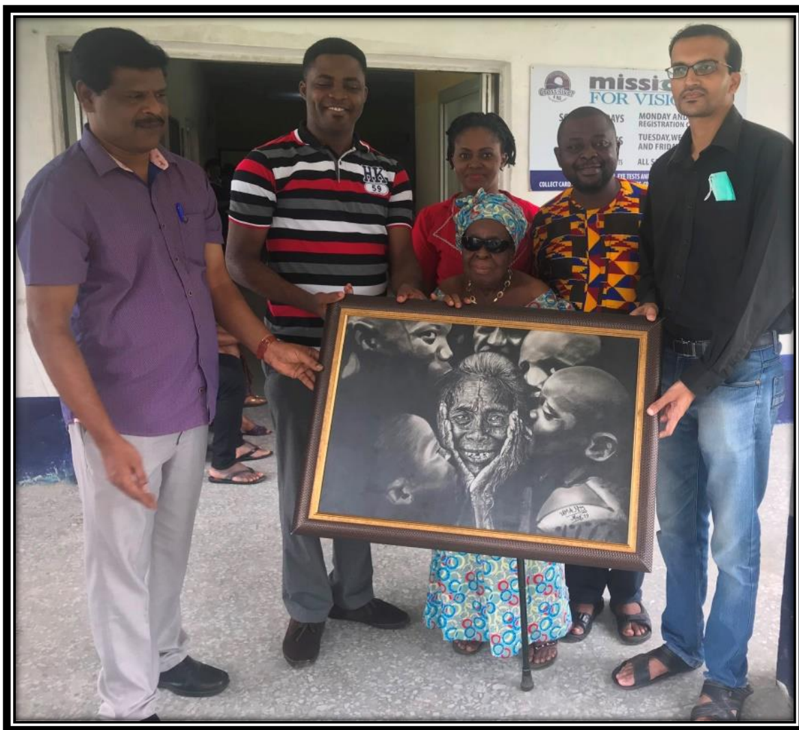
Painter (son-in-law), patient with TCF team – Presenting the artwork to TCF