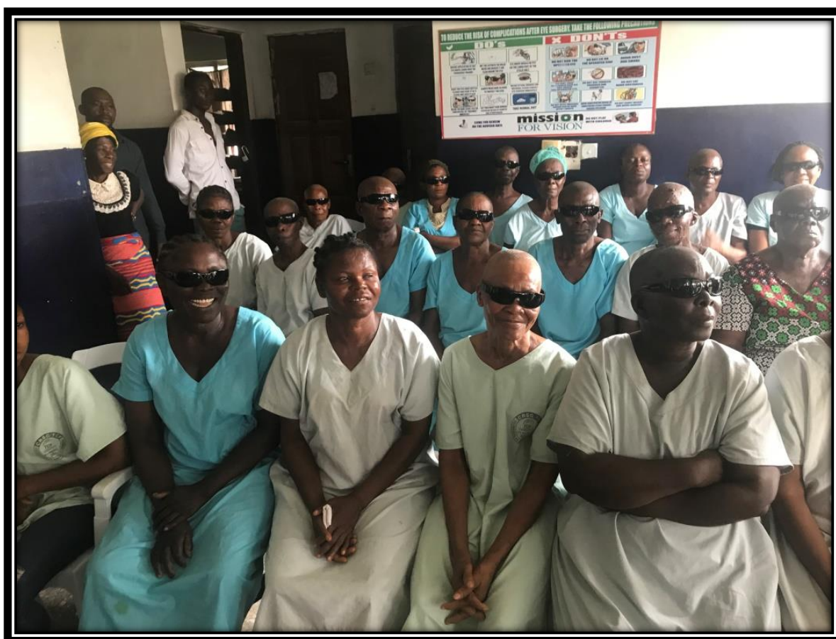
Patients – Post Surgery Counselling and Discharge

“We are very Happy to regain the sight – Thanks to TCF and the DONORS ”