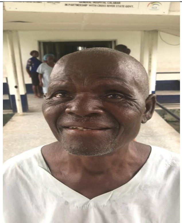
After Surgery – on his own