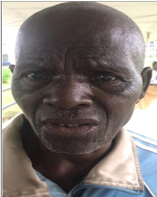
Before Surgery – led by his son